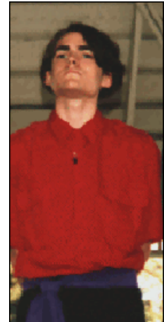
Waiting to speak at the anti-hate rally.