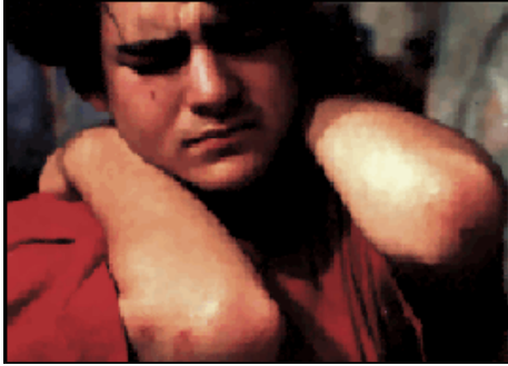
The day after the hate crime assault.